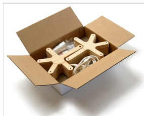
Packaged as a kitset for easy shipping